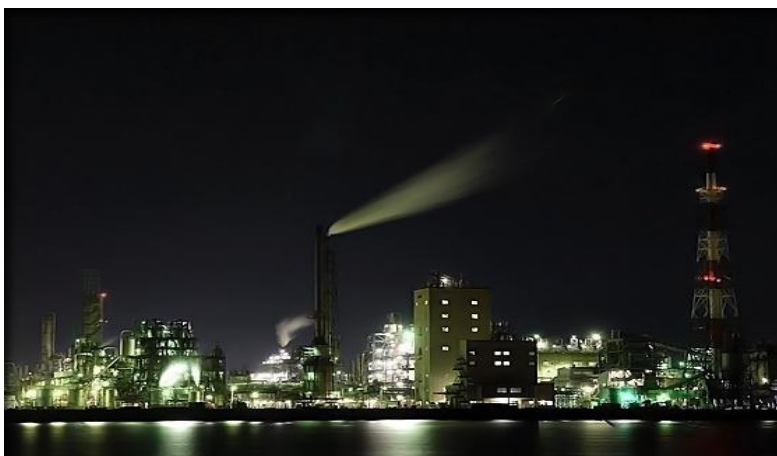
Night view of industrial complex in Shunan city

The annual turnover of these companies is the highest in West Japan, and reaches several trillion yen. Therefore, the service-producing industry of the eating of Shunan city etc. develops, and offers an enough part-time job for the international student.